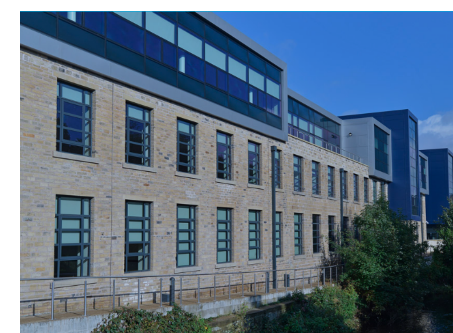
3M Buckley Innovation Centre

Address: Firth Street, Huddersfield, HD1 3BD, UK